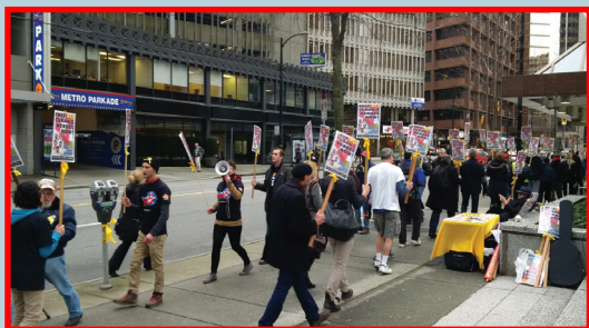
100th Picket Action at US Consulate in Vancouver