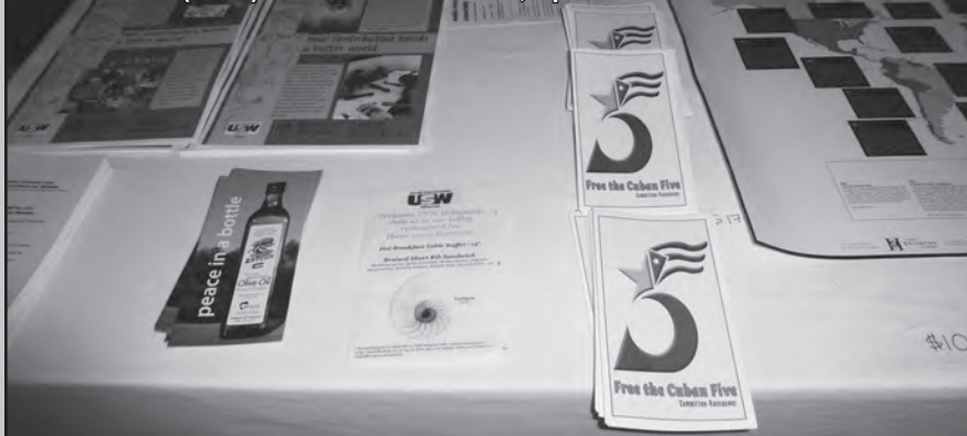
Free the Cuban 5 Committee - Vancouver brochures distributed in the United Steelworkers (USW) National Convention, April 2013